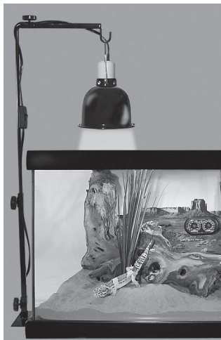
MINI DEEP DOME LAMP FIXTURE SUSPENDED FROM REPTILE LAMP STAND

the terrarium. Do not allow children or your terrarium animals to contact heat lamps or this lamp fixture. Read all safety instructions before use.