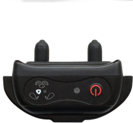
Contact Points with Rubber Caps