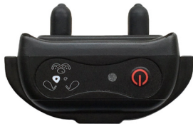
Contact Points with Rubber Caps