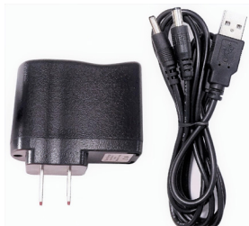
Charger and USB Cable

Note: PetSpy has 2 models of Premium Dog Training Collars: M919-1 and M919-2 (for 2 dogs). This manual is designed for both models. Visit www.petspy.com to download this guide.