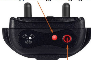
Power On/Off (1 press) Re-sync (hold for 5 seconds)