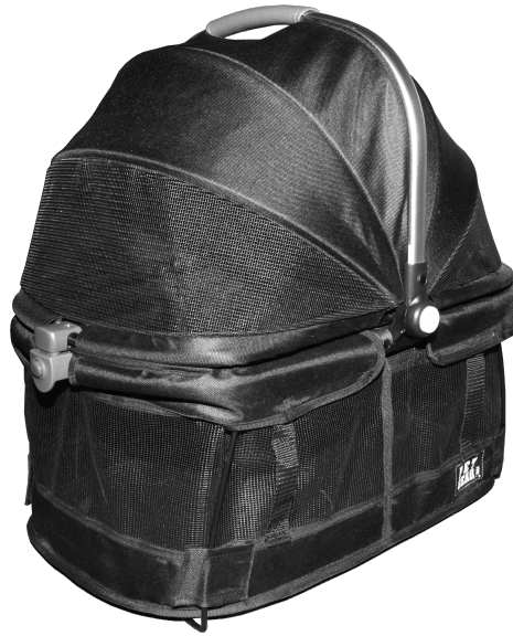
View 360 Carrier

Check that you have all the parts shown BEFORE assembling your product. If any parts are missing, call Customer Service.