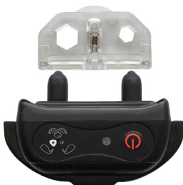
Testing Light Kit