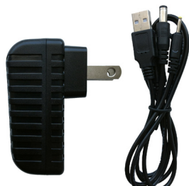
Charger and USB Cable

Note: PetSpy has 2 models of XPro Dog Training Collars: XPro (for 1 dog) and XPro-3 (for 3 dogs). This manual is designed for both models. Visit www.petspy.com to download this guide.