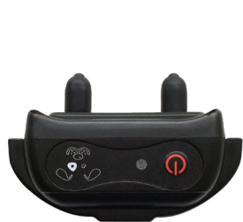
Contact Points with Silicone Caps

Frequency: 900 Mhz Transmitter: 3.7V 500mAh LiPo Receiver: 3.7V 500mAh LiPo