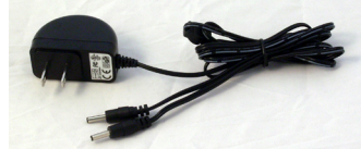
ET-1 Dual Charger

(The charger has two plugs, one to charge the collar and one to charge the transmitter.)