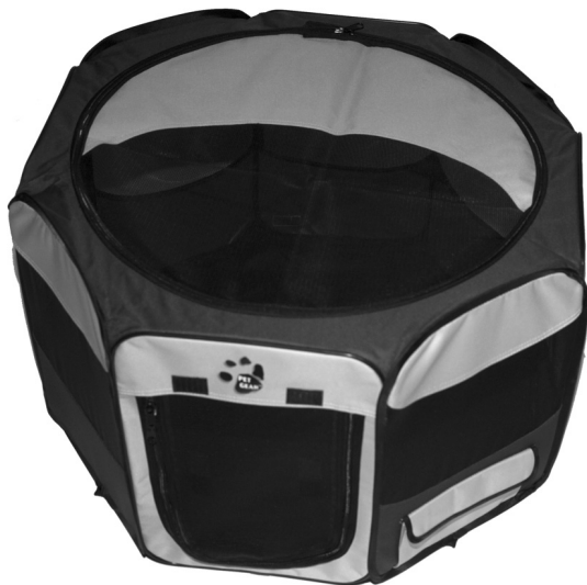
Shown open with all sides in place.