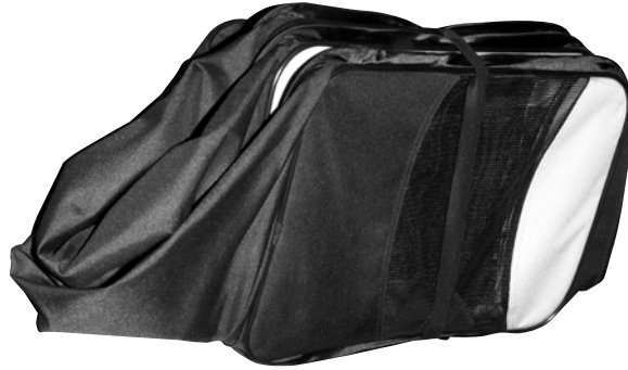
Soft-Sided Pet Pen

Check that you have all the parts shown BEFORE assembling your product. If any parts are missing, call Customer Service.