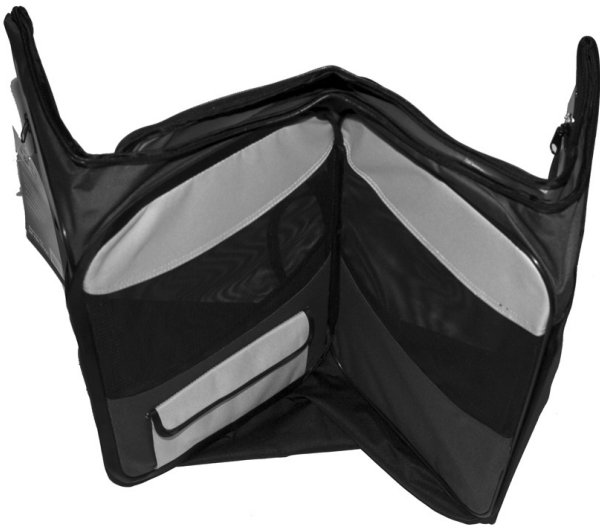
Pen shown opened with several sides snapped into place.

Step 3. Push sides outward until they snap into place.