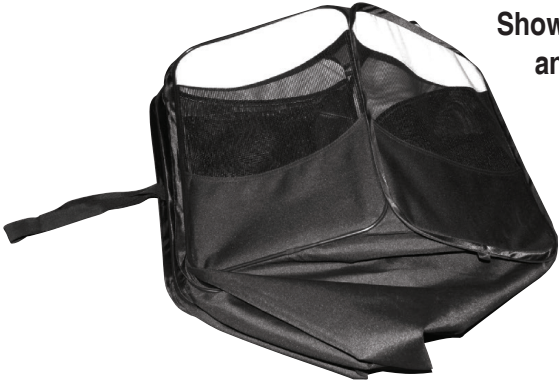
Shown closed and flat.

Step 1. Unfold pen, and pull outward, and push sides into shape. The sides snap right into place.